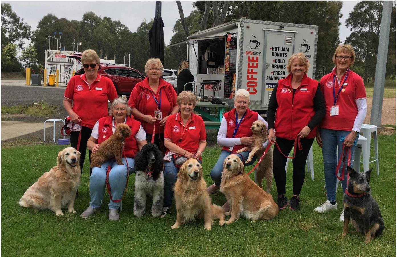
The Therapy Team grabbing a well-earned coffee after one of their visits

Pictured below is our wonderful Therapy Dog group which visits five Aged Care facilities every month. Needless to say the group is very busy. Residents, staff, dogs and handlers all look forward to our dogs' visits.